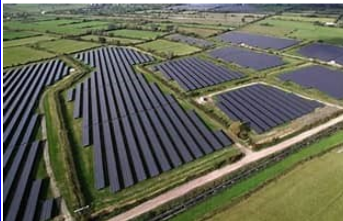
Solar Farm Example.

This change will see the number of Dalton Estate tenant farmers affected reduced but could still mean that a number will lose sufficient acreage to render their businesses untenable and therefore that they lose not only their business but their homes and futures.